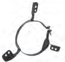
Adapter Kit 619432-174 for Fleximount